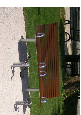
③ Mod. 35 con pedali